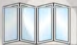
Type 440 (404) - No external access or traffic door with this design