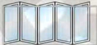
Type 550 (505)