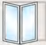
Type 220 (202) -

No external access or traffic door with this design.