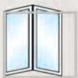
Type 220 (202) - No external access or traffic door with this design