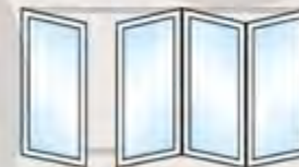
Type 413 (431)

No external access or traffic door with this design.