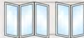
Type 532 (523)