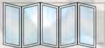
Type 550 (505)

No external access or traffic door with this design.