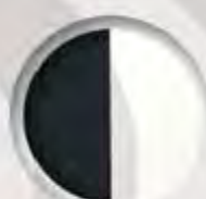
Anthracite Grey/Signal White Flat/Matt RAL 7016 / 9003