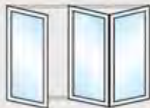
Type 312 (321)

No external access or traffic door with this design.