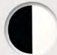
Jet Black/Signal White Flat/Matt RAL 9005 / 9003