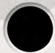
Jet Black Flat/Matt RAL 9005