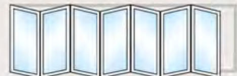
Type 770 (707)

No external access or traffic door with this design.