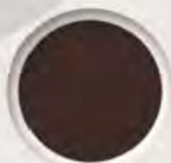
Chocolate Brown Flat/Matt RAL 8017