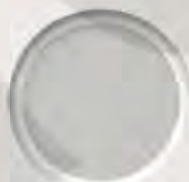
Agate Grey Flat/Matt RAL 7038