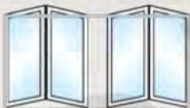
Type 422 - No external access or traffic door with this design