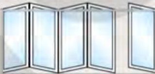
Type 541 (514)