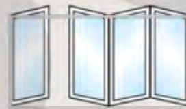
Type 413 (431)