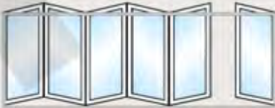
Type 651 (615)