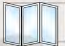
Type 330 (303)