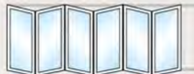
Type 660 (606) -

No external access or traffic door with this design.