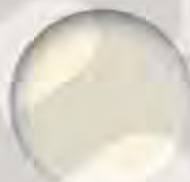
Cream Flat/Matt RAL 9001