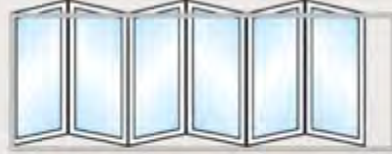
Type 660 (606) - No external access or traffic door with this design