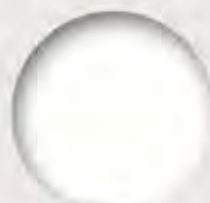
Signal White Flat/Matt RAL 9003