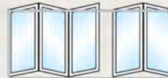
Type 532 (523)