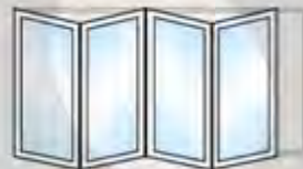
Type 440 (404) -

No external access or traffic door with this design.