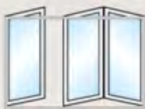
Type 312 (321)