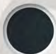
Anthracite Grey Flat/Matt RAL 7016