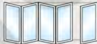
Type 541 (514)