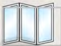
Type 330 (303)