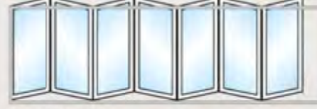
Type 770 (707)